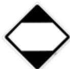
Limited Quantity Ground